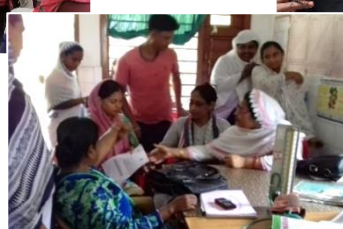
VHSNC members monitor services at an HWC