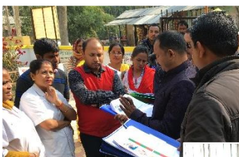
Orientation of district master trainers