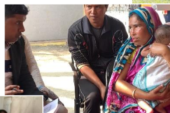
Patient feedback is collected