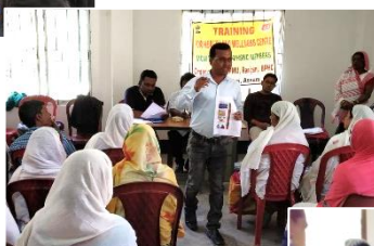
Orientation of VHSNC members