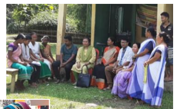
VHSNC members hold a dialogue with the HWC's Community Health Officer and ASHA Supervisor