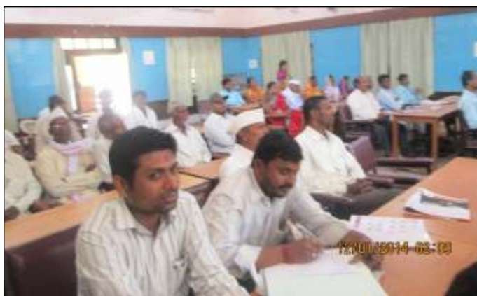
PRI Members active participation in PRI Convention - Beed

In all the conventions, the people's representatives expressed that they find the process of CBMP useful for monitoring of health services at the local level. Especially when they face some technical problems, they find the involvement of NGOs useful. They also