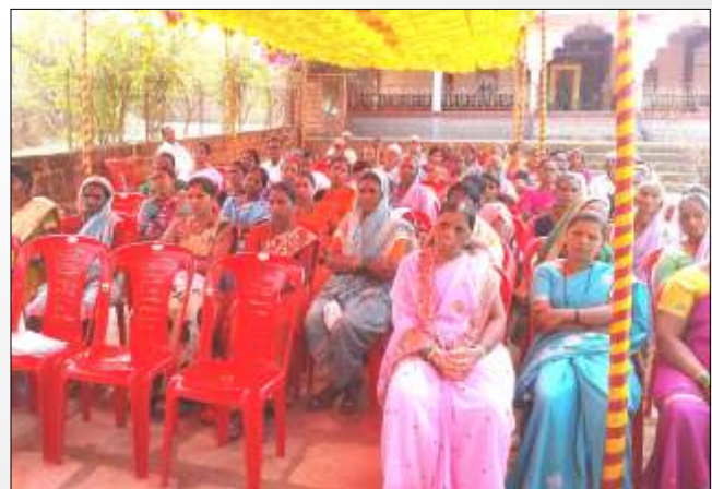
Zilla Parishad members taking up issues in Jan Samvad organised by Sangram in Kolhapur district