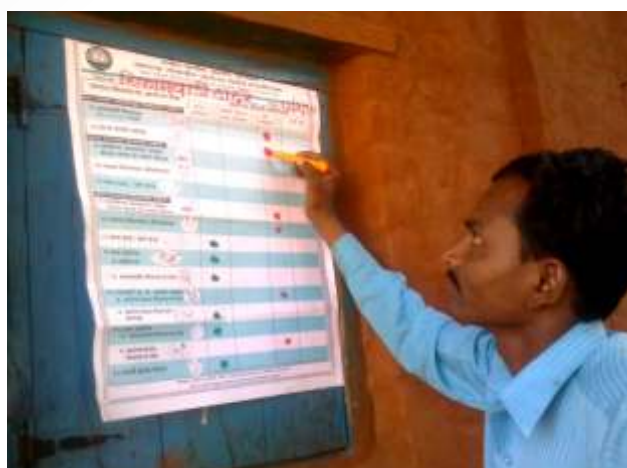
Putting up a report card in village 'Rikamwadi'

The Regional resource persons have co-ordinated with these newly involved organisations and have provided guidance to enable them to conduct health rights awareness activities, community based data collection, documentation of cases of denial of health care and preparation for Jan samvads. These organisations are drawn from 8 new districts (where CBMP has not yet been implemented), covering 16 talukas. In each taluka, these organisations have facilitated collection of data from at least 3 PHCs and 15 villages. Since the regular CBMP tool for data collection was quite detailed, it was made concise for this exercise, so that it covered basic services in the PHC. For example on medicine availability, only the stock of 11 essential medicines was examined. With appropriate training and guidance from SATHI, these organisations have carried out brief data analysis, and have prepared report cards which are displayed on large flex posters during the Jan samvads. 14 such Jan samvads in new areas have been organised so far, a couple of Jan samvads in such