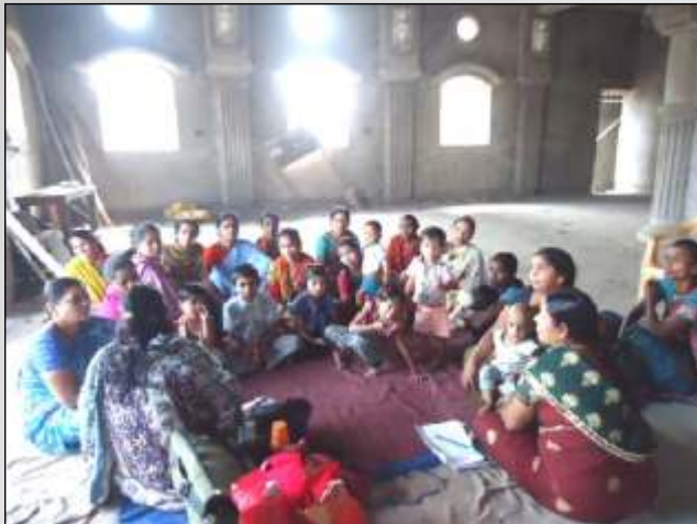
Village meeting regarding Anganwadi Services - Pune