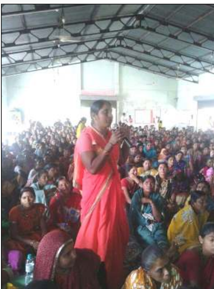
Women question the medical officer in Jansunwai.

Another Jan sunwai was conducted in Karanja taluka of Washim district on 25 February 2014. The CSO involved was 'Manoday' which has a large network of self-help groups, resulting in a large mobilization of women; this was one of the best attended Jan sunwais with about 500 women and around 100 men. The organization was not sure that women would speak up at the Jan sunwai and express their problems, as they had earlier shown hesitation in publicly speaking about the doctors. However, women decided to vocally share their grievances, and finally so many of them wanted to speak that they had to be stopped due to time constraints.